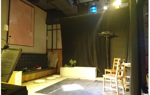
(show adapted to restaurant)