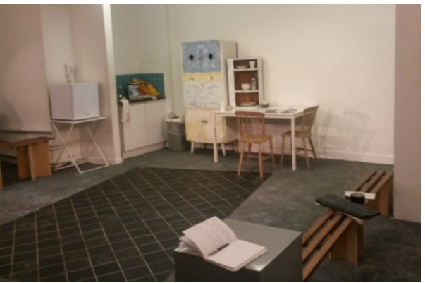
(show adapted to traditional venue space)